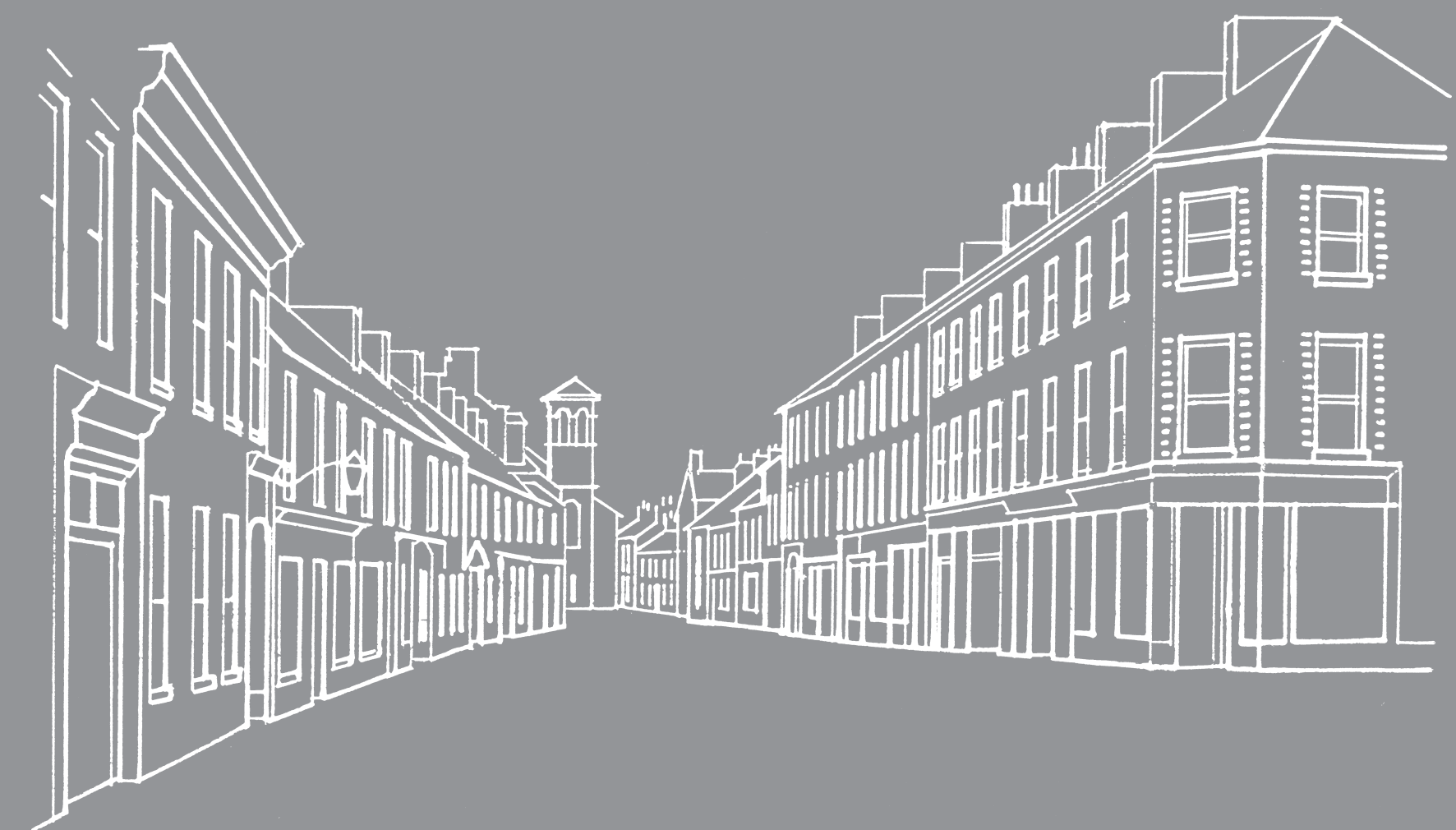
View of Church Street, c.1910

For more information on the history of Ballymoney, please visit the Tourist Information Centre & Museum in Ballymoney Town Hall.